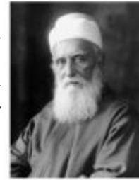
Abdul Baha, son of Baha'u'llah