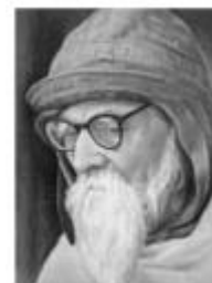
Vinoba Bhave TOP ↑